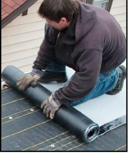
A cool coating is applied to a dark roof (top), and a cool single-ply membrane roof is unrolled (bottom).