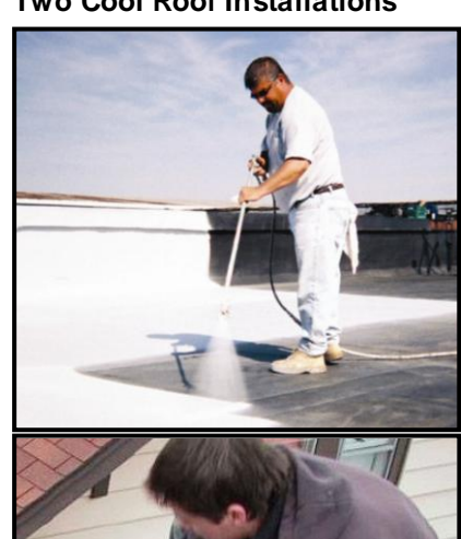
Figure 6: Two Cool Roof Installations

Shingled Roofs consist of overlapping panels made from any of numerous materials. Fiberglass asphalt shingles, commonly used on homes, are coated with granules for protection. Cool asphalt shingles are use specially coated granules that provide better solar reflectance. While it is possible to coat existing asphalt shingles to make them cool, this is not normally recommended or approved by shingle manufacturers. Other shingles are made from wood, polymers, or metals and these can be coated at the factory or in the field to make them more reflective. Metal shingles are described in the Metal Roofs section that follows.